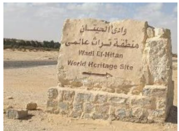
Fig. 1. Egypt’s famous Valley of the Whales* is in the midst of a vast, barren desert. * In transliterations of the area’s Arabic name, the definite article is more usually ‘Al’ than the alternative spelling ‘El’, as here.

All images by Gary Bates unless otherwise attributed entry-wadi-el-hitan