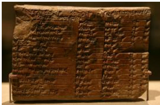
Ancient tablet: The clay tablet shows how the Babylonians used Pythagorean triples