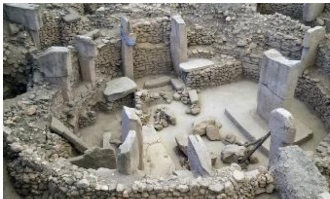
A megalithic enclosure at Göbekli Tepe in south-east Turkey.

Another unexpected result of recent archaeological research, causing many to revise their view of prehistoric hunter-gatherers, is the appearance of monumental architecture. In Eurasia, the most famous examples are the stone temples of the Germus mountains, overlooking the Harran plain in south-east Turkey. In the 1990s, German archaeologists, working on the plain's northern frontier, began uncovering extremely ancient remains at a place known locally as Göbekli Tepe. What they found has since come to be regarded as an evolutionary conundrum. The main source of puzzlement is a group of 20 megalithic enclosures, initially raised there around 9000BC, and then repeatedly modified over many centuries.