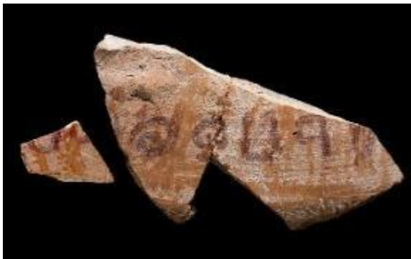
PHOTO: The 'Jerubbaal' inscription, written in ink on a pottery vessel, discovered at Khirbet al-Ra'i.

A five-letter inscription from biblical times was found at the Khirbet al-Ra'i dig site in central Israel, between Kiryat Gat and Lachish, about 43 miles southwest of Jerusalem. This unique discovery offers us a 3,100-year-old glimpse back in time and ties the Bible with archaeological history.