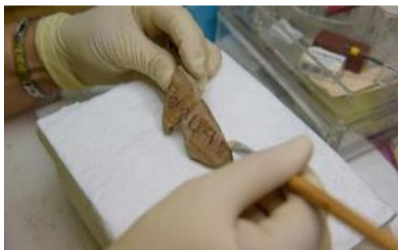
PHOTO: The 'Jerubbaal' inscription during the conservation process.